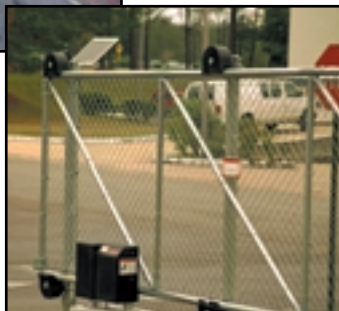
Gate Operator

UNI-SOLAR framed panels are for permanent, fixed position mounting with optimum tilt, wind resistance and exposure to sunlight. These glass-free, lightweight, unbreakable modules can be utilized in a wide variety of applications from fence charging to telecommunications.